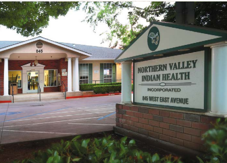
Chico - East Ave