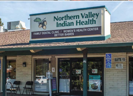
Chico - Cohasset Road