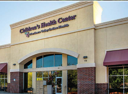
Chico - Springfield Drive